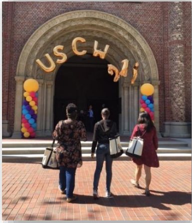
Youth survivors attending USC's Women's Empowerment Conference.

CAST's Youth Program was created in 2014 as a response to the increase in referrals of youth survivors of human trafficking, and the specialized needs of minor and transition aged youth (TAY) survivors. The Youth Program's mission is to provide youth-centered services to survivors of trafficking 24 and under by empowering youth and their support system to transform their trauma into their own story of healing and to build a future of hope and resiliency. The youth program engages youth from crisis care to long term case management and advocacy support, applying youth-centered engagement interventions and celebrating EVERY success along their journey. The youth program collaborates with youth-focused partners in the community, including service providers, government systems, mentorship and educational opportunities to further support each youth's goals and dreams. The youth program is committed to creating a safe and nonjudgmental space for survivors while conducting outreach and awareness in the community and revolutionizing programming to encourage successful graduation from the youth program.