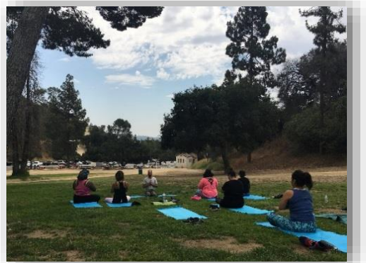
Shivakali Yoga facilitating a yoga class at the park

CAST's Youth Program hosts monthly activities focused on self-empowerment, positive experiences, and personal development to connect youth survivors of trafficking with one another in fun and supportive ways. The Youth Program began these group activities after youth survivors expressed wanting opportunities to connect with other youth who have experienced similar stories. The monthly activities have included spoken-word, yoga, indoor rollerblading, film screenings, empowerment conferences, and self-care/wellness events. CAST continues to collaborate with community partners and agencies to host monthly youth activities in order to increase the breadth of positive experiences for youth survivors.